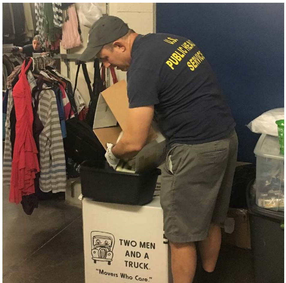
Sorting clothing in the PATH thrift store.