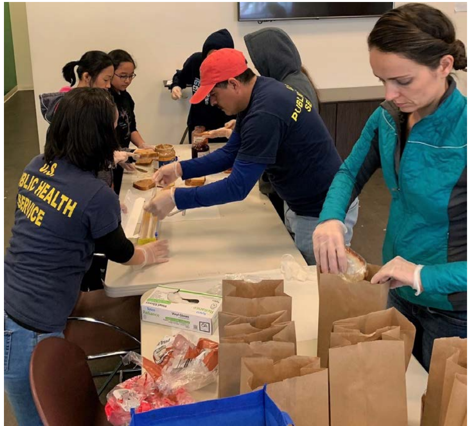
Volunteers stuff sandwich bags at People Assisting the Homeless (PATH).

People Helping the Homeless. https://www.epath.org/